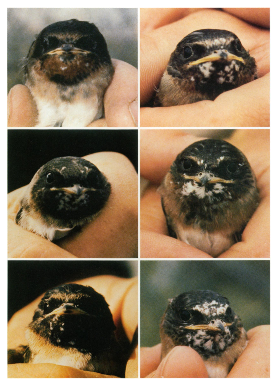
FRONTISPIECE. Faces of six fledging-aged Cliff Swallows. The three on the right are from the same nest.